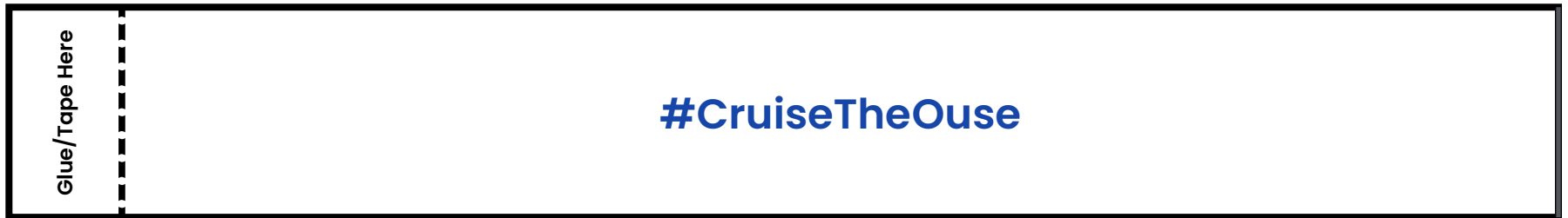
Right Side Piece