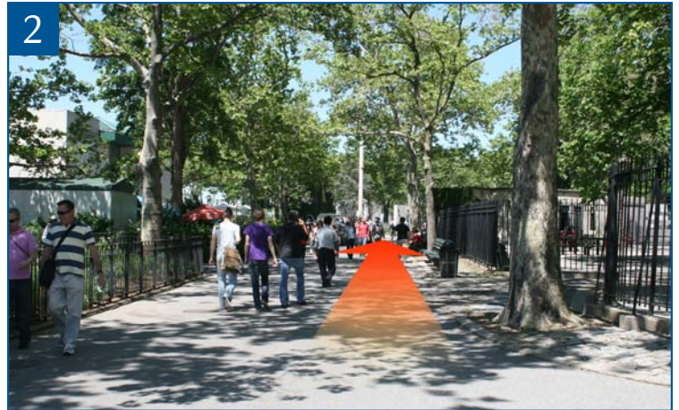
2 Walk further on this path until you pass a flag pole, and continue walking straight ahead.