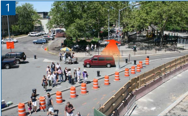
1 From the Staten Island Ferry Terminal, head west towards Battery Park. You will see a path way with a playground on your right.

For further questions, please call 877.523.9849