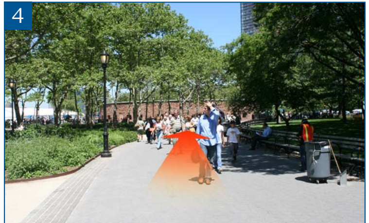
4 To purchase tickets, walk through to the middle of the building. If you already have a “Reserve Ticket” you may go straight to the security screening tent located behind Castle Clinton, along the seawall. If you have a “Flex Ticket”, ask a uniformed crew member for the end of the flex line.