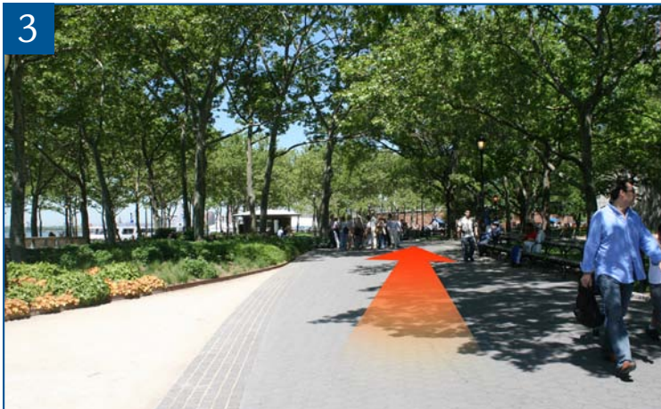
3 As you continue, you should see Castle Clinton, a circular brick fort in the distance.