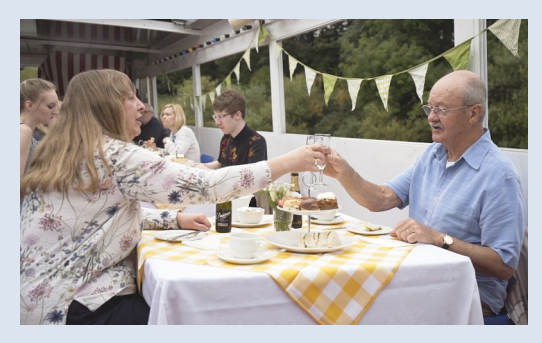
Afternoon Tea Cruise

Departs from the King's Staith Landing only